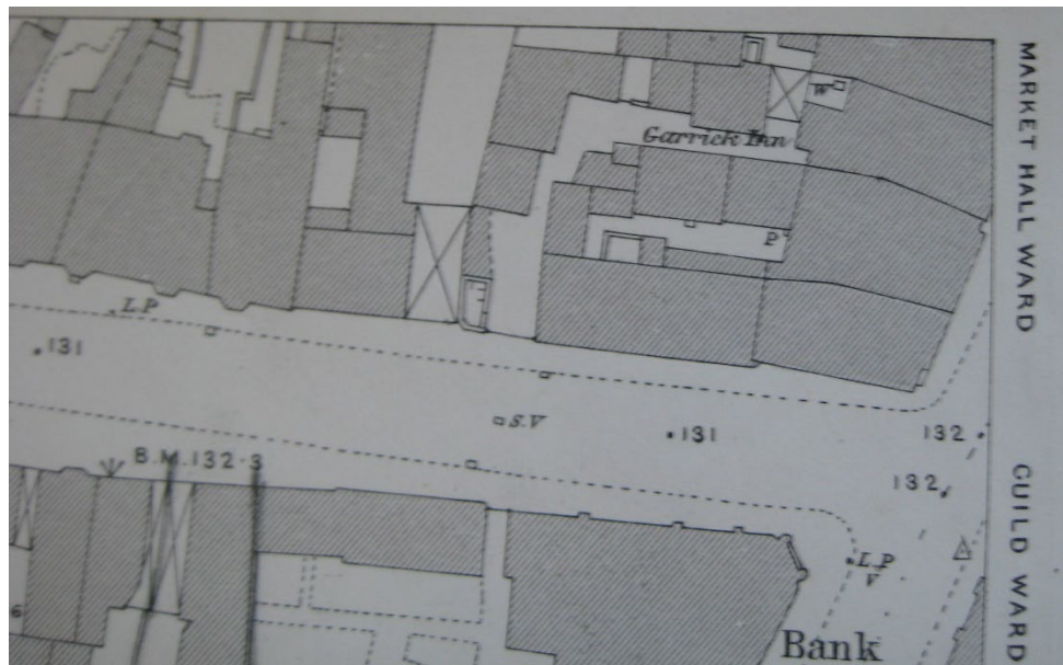
Fig. 3: 1886 OS Town Plan