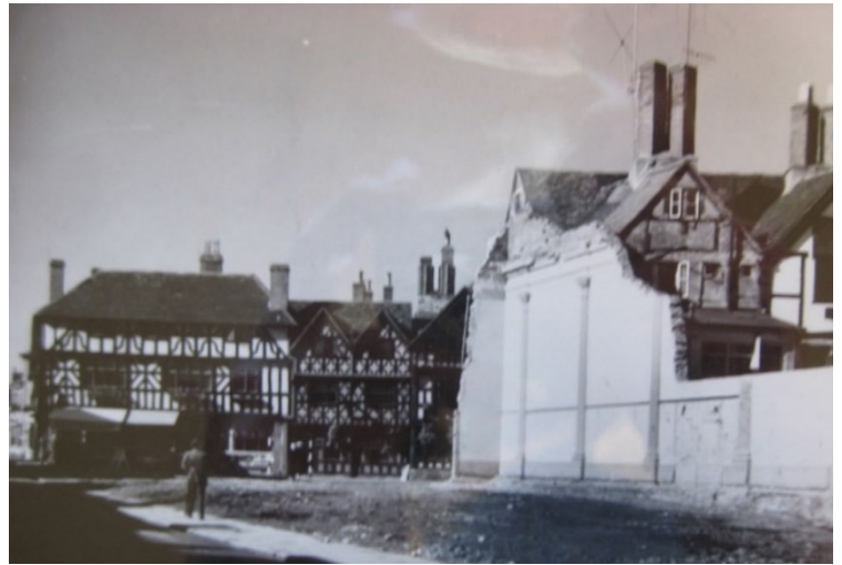
Fig. 2: site of the Corn Exchange, c.1958, after its demolition