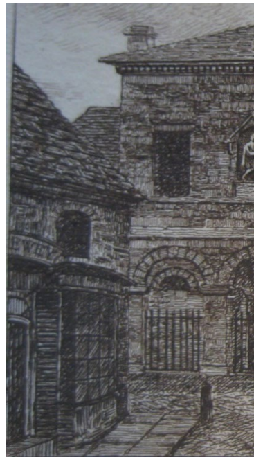
Fig. 4: Similar view when Thomas Newey was tenant of the corner property, 1815-30