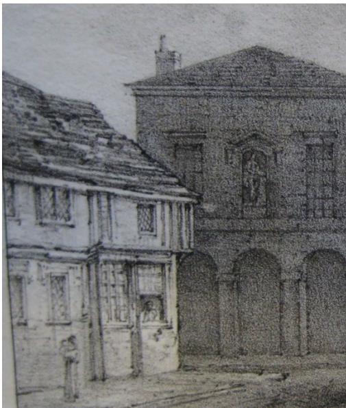
Fig. 3: Town Hall and No. 22 High St, 1810