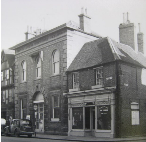
Fig. 1: The Corn Exchange and the Sheep St corner c.1950