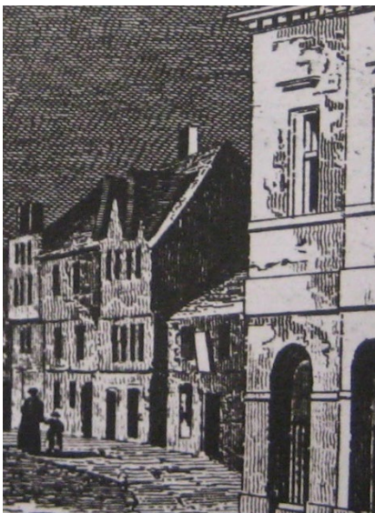
Fig. 5: view of the south end of High St, c.1825, showing No. 22 in use as an inn.