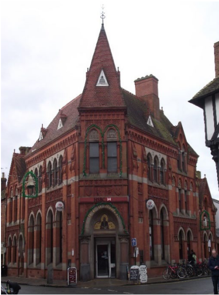
Fig. 1: HSBC bank, viewed from the north, 2023