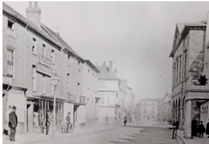
Fig. 2: Chapel St looking north showing on the left buildings on the corner of Ely St, c. 1870