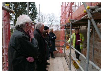
North transept of church