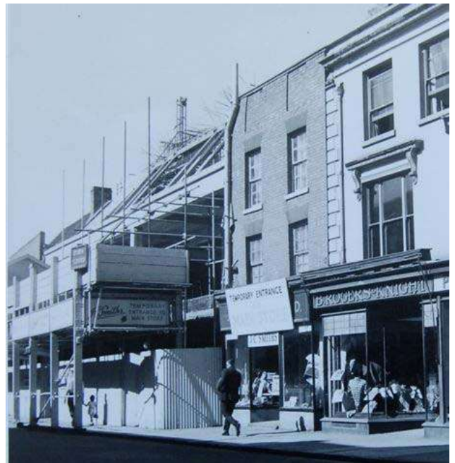
Fig 4 : Demolition of Nos 33/4 and 35 High St, c. 1960