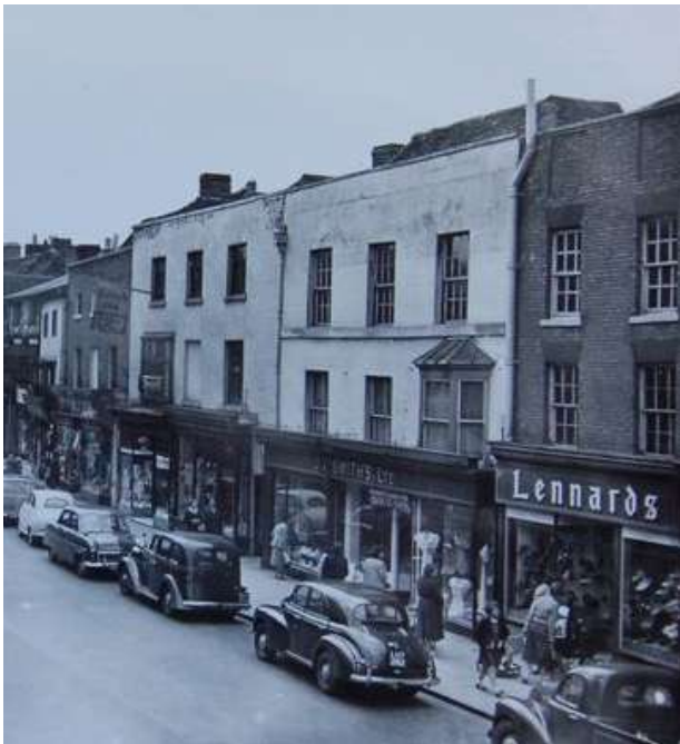
Fig 3: Nos 33/4 (left) and No. 35 High St (right), c. 1950