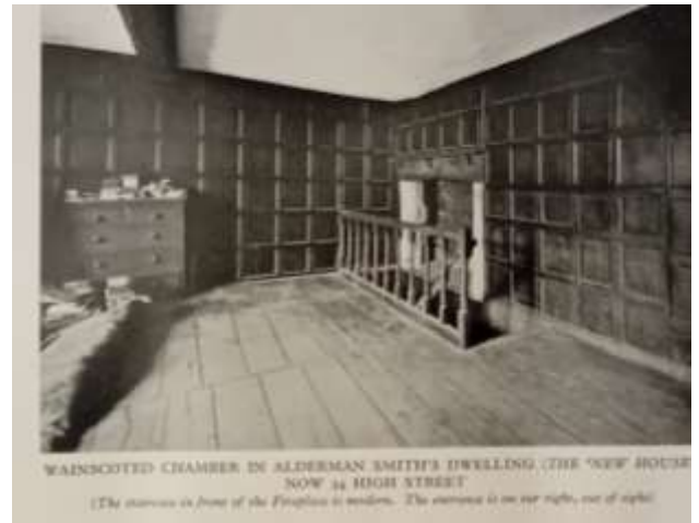
Fig 2: Illustration from Fripp's Shakespeare Studies , 1930, of possibly the same room.