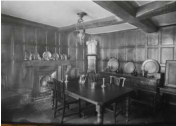
Fig 1: Image of one of the wainscoted rooms, c. 1890