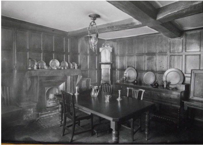
Fig 1: Image of one of the wainscoted rooms, c. 1890