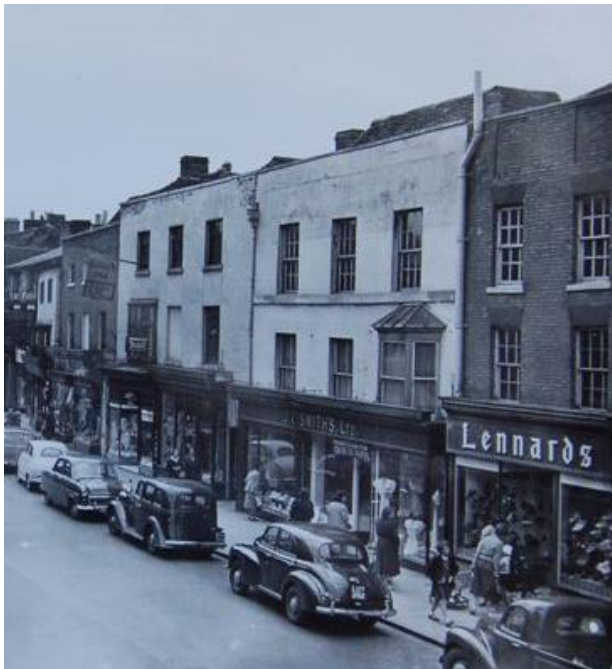
Fig 3: Nos 33/4 (left) and No. 35 High St (right), c. 1950