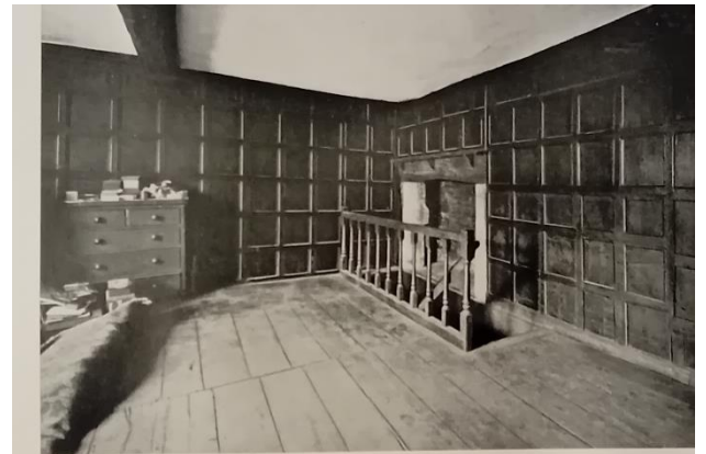
WAINSCOTED CHAMBER IN ALDERMAN SMITH'S DWELLING (THE 'NEW HOUSE' NOW 34 HIGH STREET (The staircase in front of the Fireplace is modern. The entrance is on our right, out of sight)