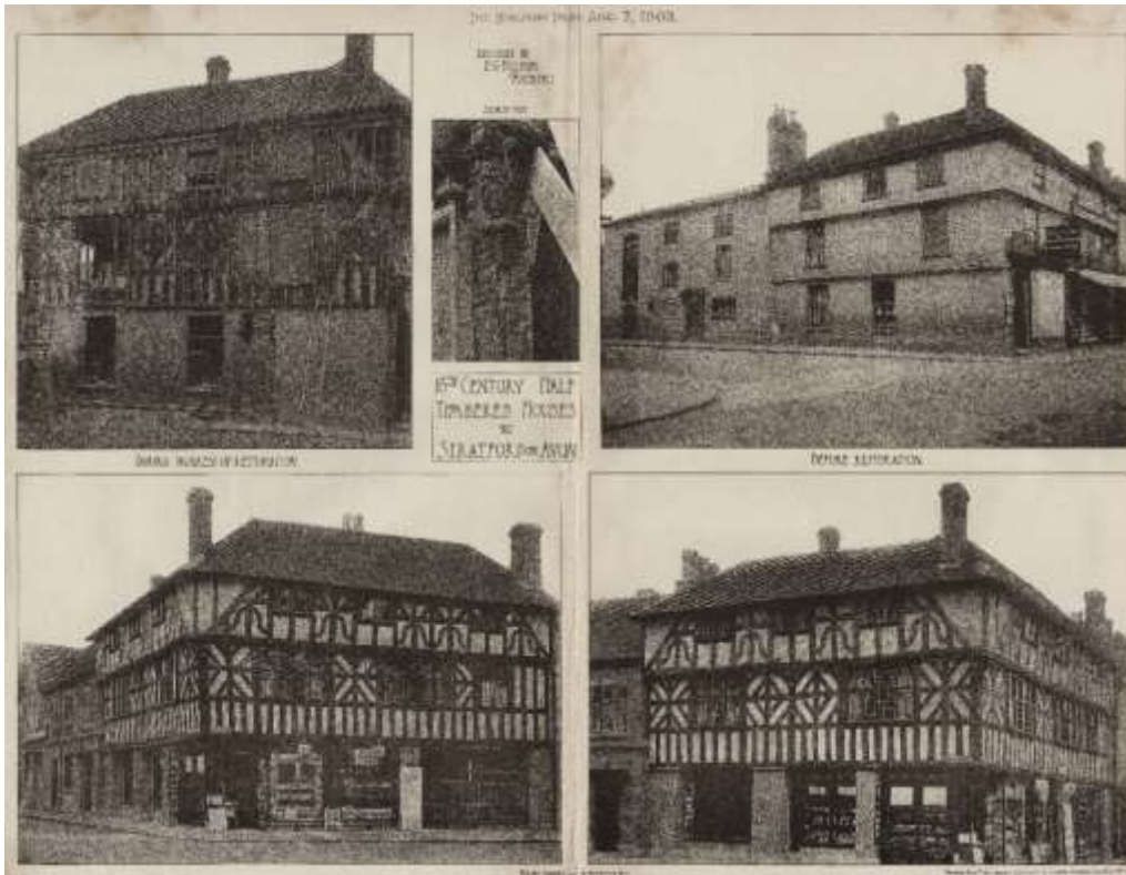
Fig. 3 Building News, 7 August 1903