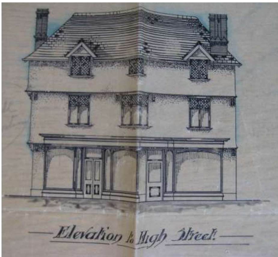
Fig. 2 Initial restoration plan 1902 (BRR 49/1/255)