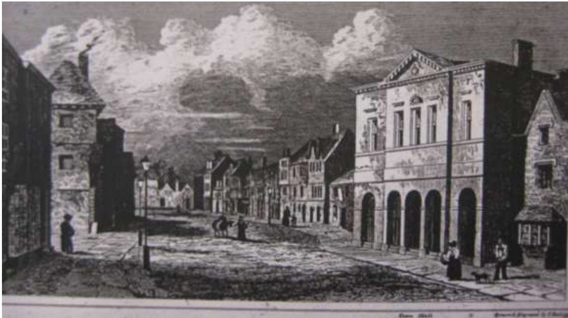
Fig. 1 High Street, c. 1830, engraved by Thomas Radclyffe