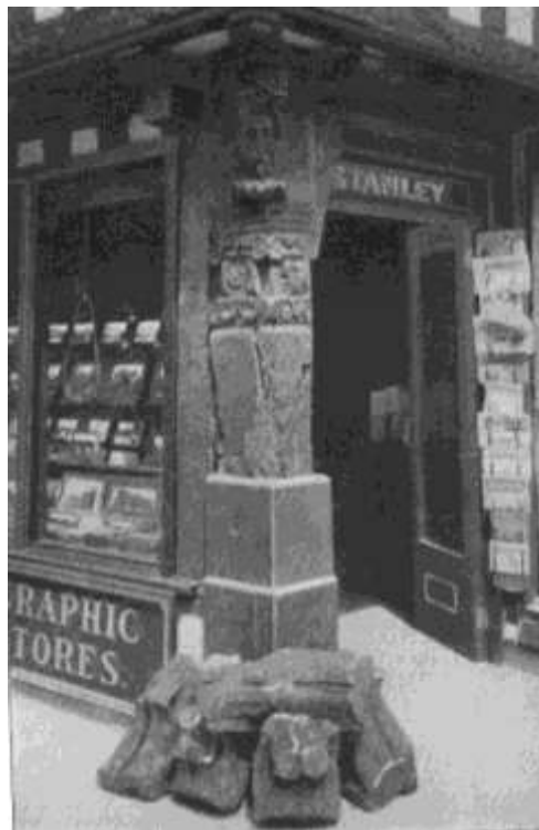
Fig. 4 Forrest, Old Houses of Stratford-on-Avon : corner post (facing p. 69)