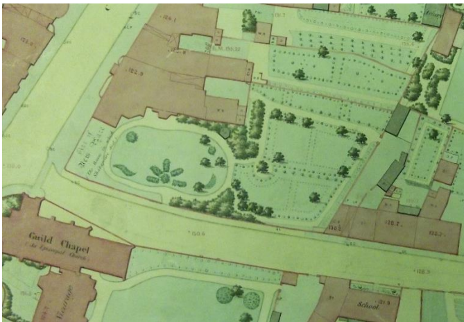
Fig 2: extract from the Board of Health plan, 1851