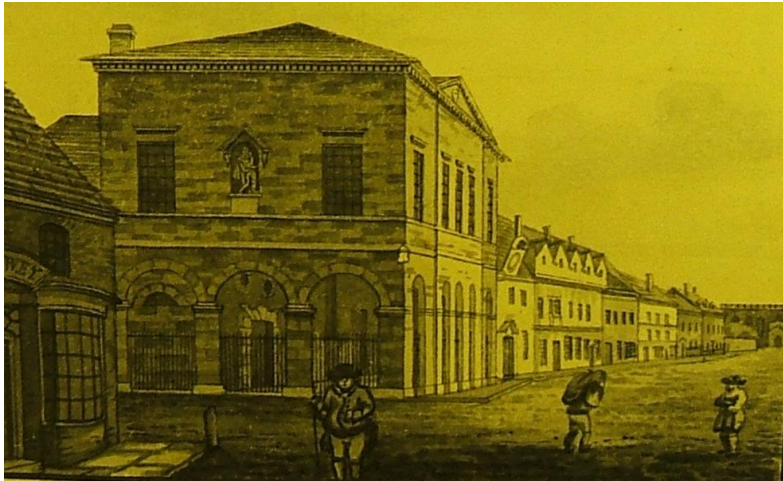
Fig. 1: James Saunders' view, early 1820s, of the east side of Chapel St with a distant prospect of No. 22 as the final house in the street.