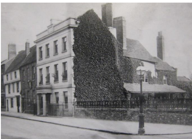
Fig. 4: Nash's House, c. 1910