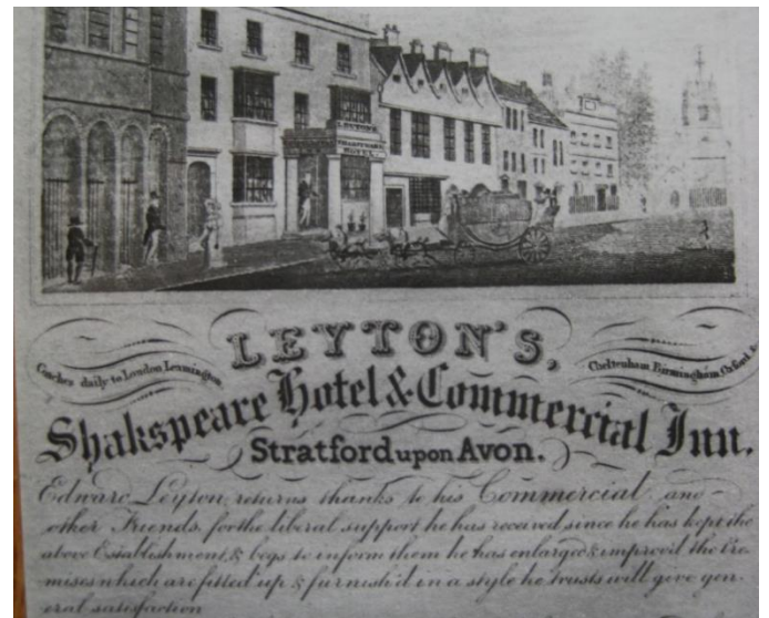
Fig 3: Advertising card, 1820s, showing Nash's House with its new frontage, at the end of the street