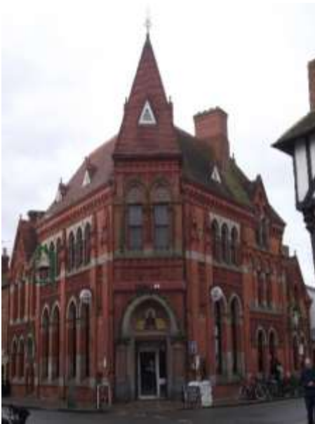
Fig. 1: HSBC bank, viewed from the north, 2023