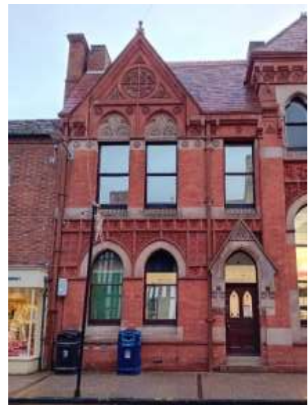
Fig. 4: site of No. 12 Chapel St, 2023.