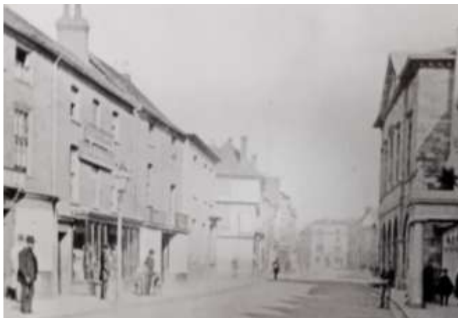
Fig. 3: Chapel St looking north showing on the left buildings on the corner of Ely St, c. 1870.