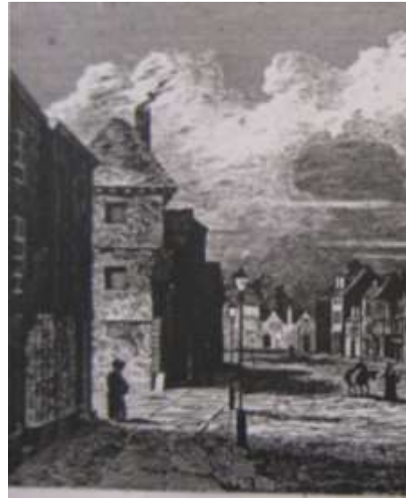
Fig. 2: High St, looking north, showing on the left, buildings on the corner of Ely St.