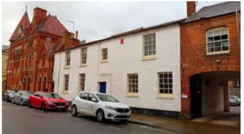
Fig. 7: No. 1 Ely St, 2023.