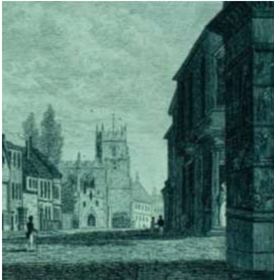
Fig. 1: Chapel St, looking south, showing on the right, buildings on the corner of Ely St.